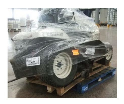
This product is too big for the pallet.

These pallets will be insecure, unsafe and easily damaged.