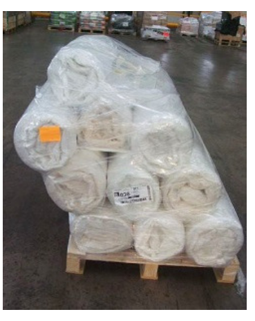
These rugs lean over the base.