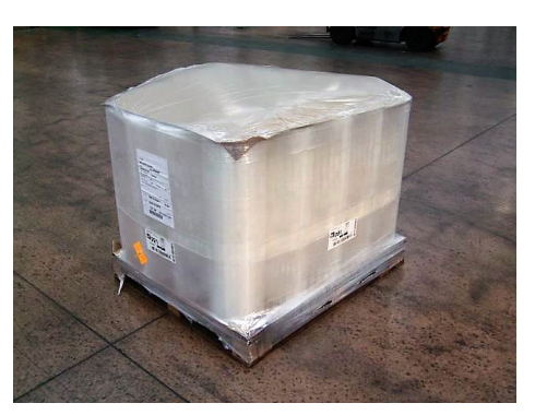
Rolls banded together and then wrapped