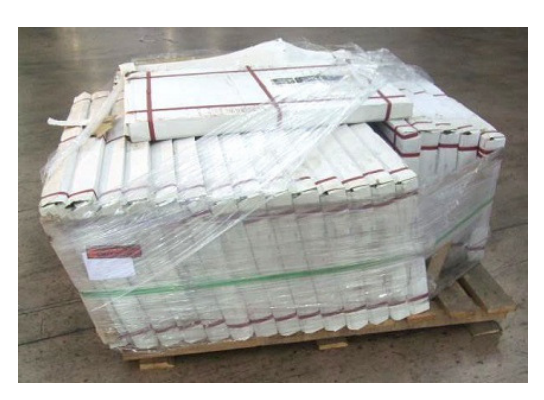
These tiles should be stacked flat, not vertically.