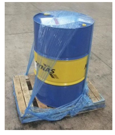
This drum is barely secured.