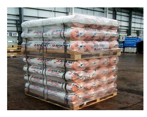
Rolls, stacked, supported, and shrink wrapped